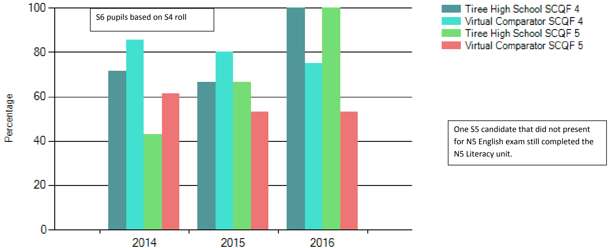
Percentage of Candidates Attaining Literacy and Numeracy

Improving attainment in literacy and numeracy